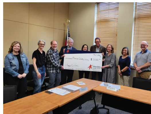
Photo of Directions Credit Union representatives presenting a donation check to the MCLS Board of Trustees, taken at the Bedford Branch Library on May 11, 2022.